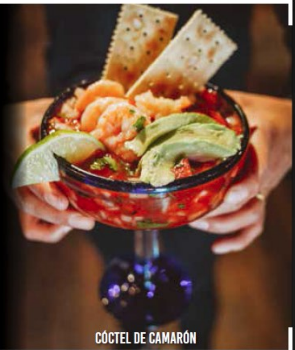
CÓCTEL DE CAMARÓN