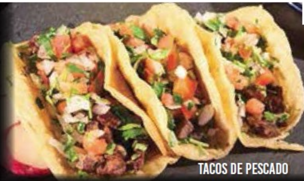
TACOS DE PESCADO